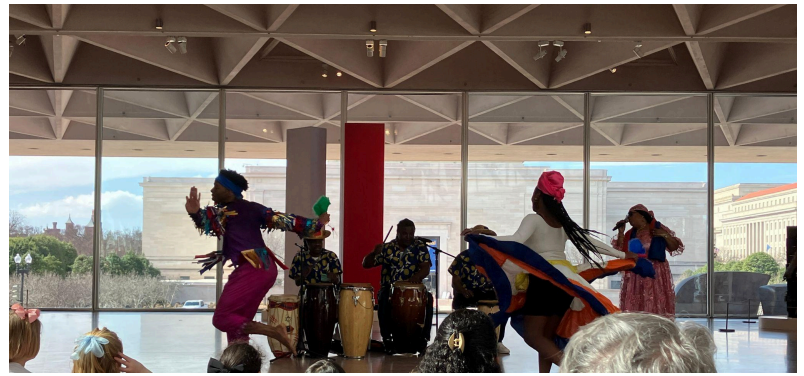
Au Musée National de l'Art Africain pour une visite guidée en Français