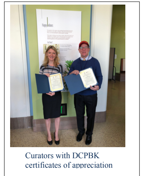
Curators with DCPBK certificates of appreciation